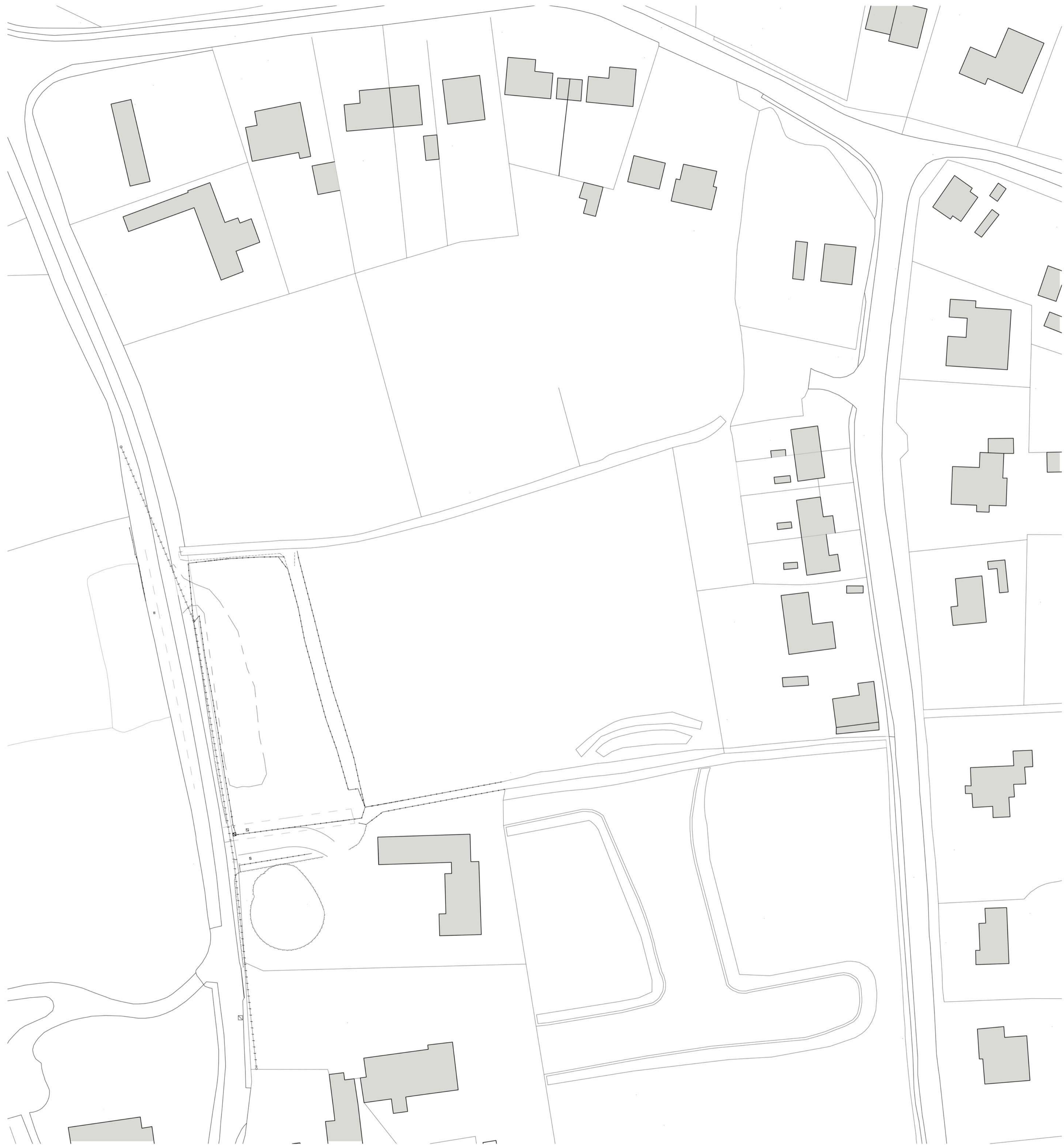
EXISTING BLOCK PLAN | 1:500